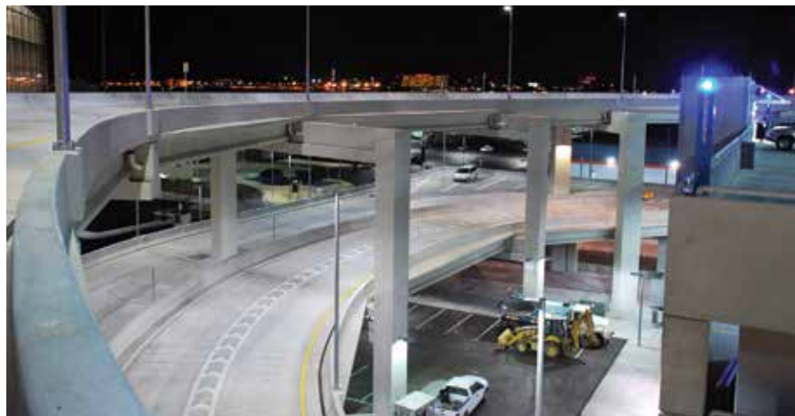
The 8-in.-thick, cast-in-place, reinforced concrete deck is supported by prestressed concrete box beams that sit on cast-in-place concrete piers and spread footings with auger-cast concrete piles.