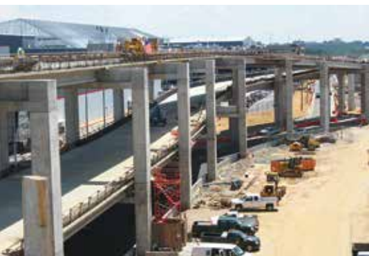
All three levels of the roadway are visible in this view. The ground level is for service access, the second level is for arrivals, and the top level is for departures.