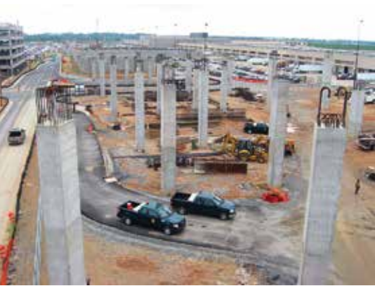
A forest of cast-in-place, reinforced concrete piers rises from the former site of a key Atlanta airport service road. Each pier is supported by spread footings and auger-cast concrete piles.